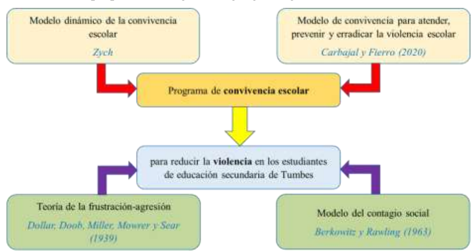
Figure 3. Outline of the proposal. In original language: English

A school coexistence program was designed divided into 15 didactic sessions to reduce violence in secondary school students, based on four theoretical foundations, the outline of which is presented below in Figure 3.