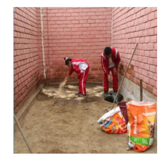
Moment 4: scientific argumentation